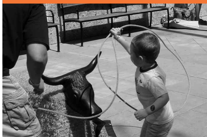
Roping lesson for the little ones at the Houston Children's Festival.