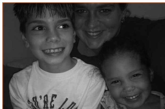
A thankful mom and her children.