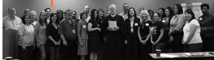
Graduates from June's Advocacy University.