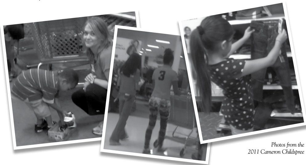
Photos from the 2011 Cameron Childspree

We would like to thank Cameron, Atwood Oceanics, Spark Energy and the Junior League of Houston for sponsoring this incredible event. And thanks also to the many volunteers who will wake up before dawn to shop with our children. We couldn't do it without you!