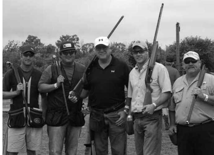
Winners from the shoot at 2012 Pull for Kids Classic.