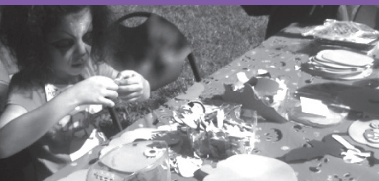
Children enjoyed crafts at the YPC Halloween Party.