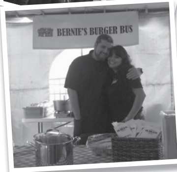
Photos from the Third annual Chili Cook-off for Kids at Hughes Hangar