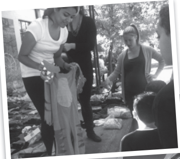
Photos from the Children's Halloween Party

October was off to a busy start for YPC when we held a College Game Day Social at Blackfinn American Grille. BCS football trivia kept everyone on their toes while we enjoyed watching a Thursday night football game. Thank you to Blackfinn for not only hosting, but for donating the delicious appetizers and drink specials as well.